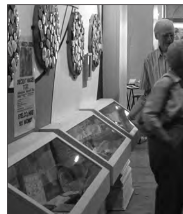
Opening of the new Hall of Hamilton Labour